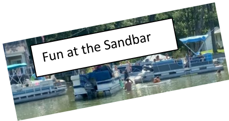
Fun at the Sandbar